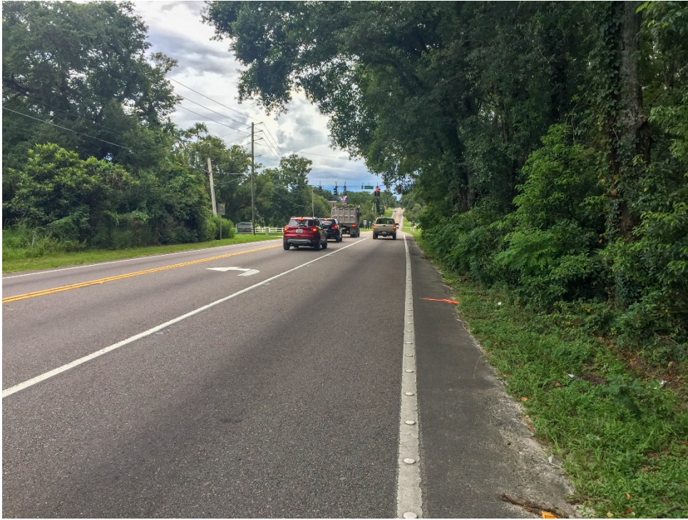
Photo No. 6: Date & Time: 2018:07:18 14:34:39 / Photo Direction of View: 81°