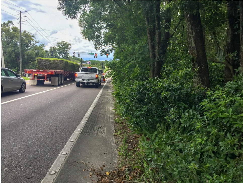
Photo No. 4: Date & Time: 2018:07:18 14:33:16 / Photo Direction of View: 89°