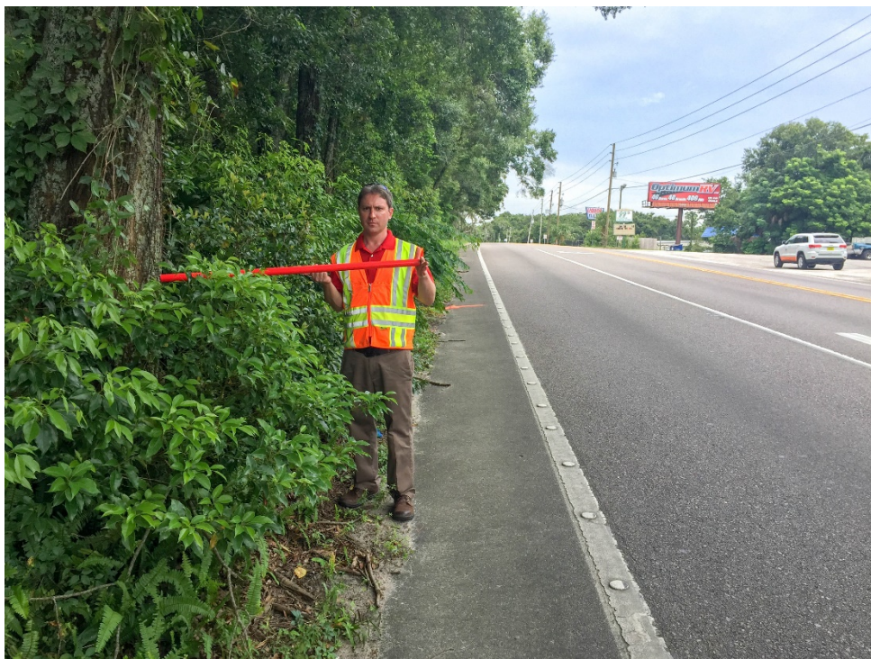
Photo No. 3: Date & Time: 2018:07:18 14:32:35 / Photo Direction of View: 269°