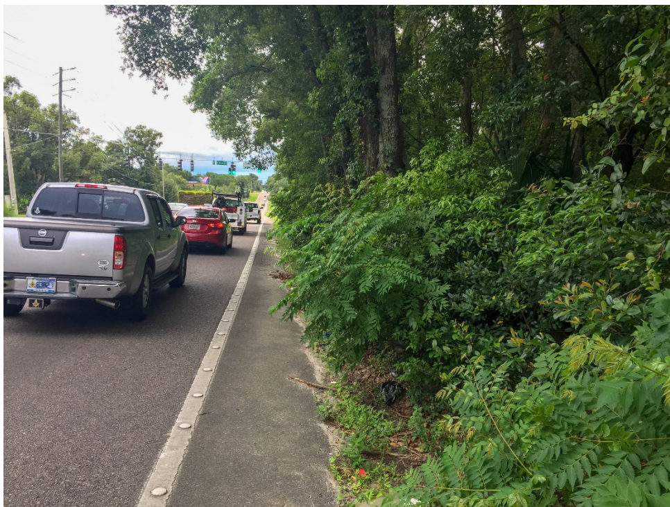
Photo No. 5: Date & Time: 2018:07:18 14:33:33 / Photo Direction of View: 89°