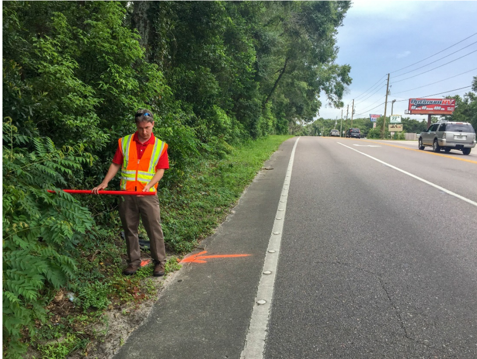
Photo No. 2: Date & Time: 2018:07:18 14:32:15 / Photo Direction of View: 262°