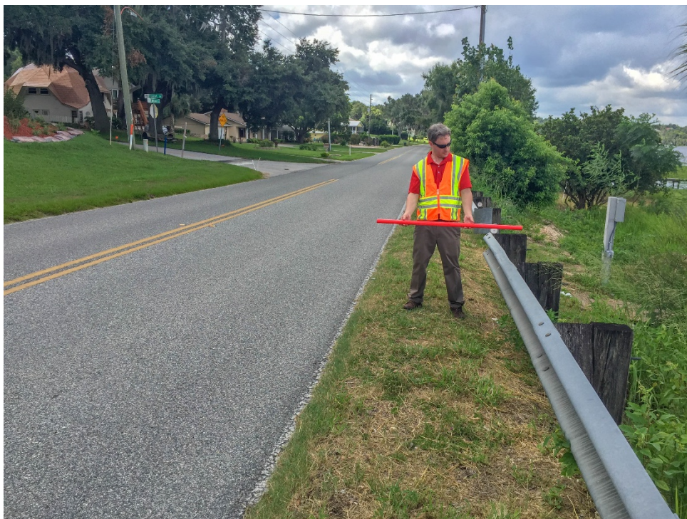
Photo No. 2: Date & Time: 2018:07:18 10:35:54 / Photo Direction of View: 166°