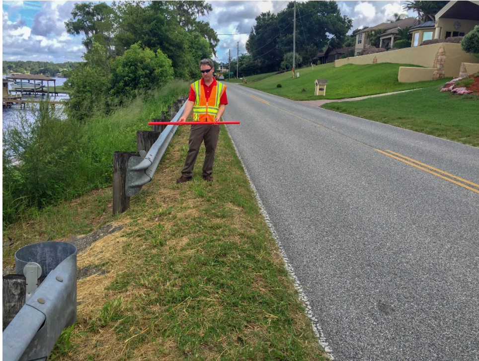
Photo No. 1: Date & Time: 2018:07:18 10:35:41 / Photo Direction of View: 357°