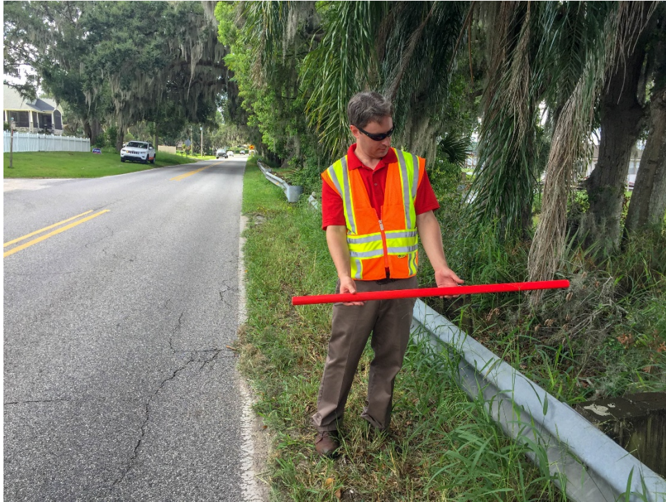
Photo No.3 : Date & Time: 2018:07:18 10:32:33 / Photo Direction of View: 187°