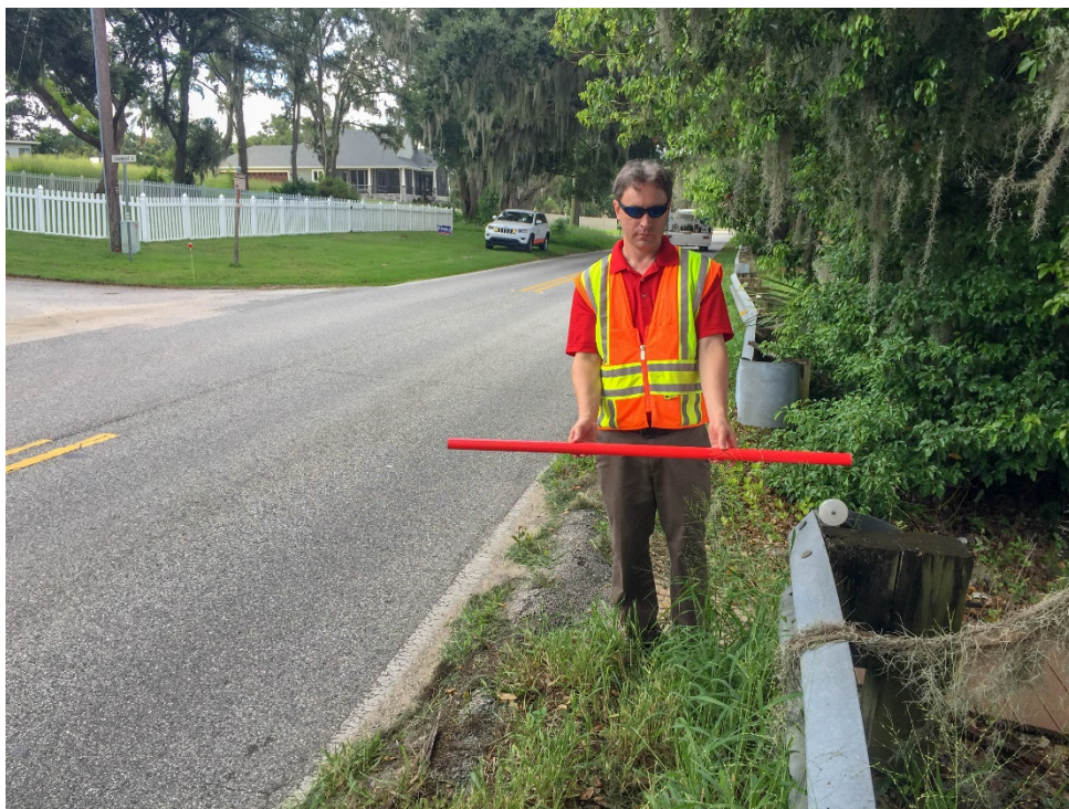
Photo No. 2: Date & Time: 2018:07:18 10:32:15 / Photo Direction of View: 177°