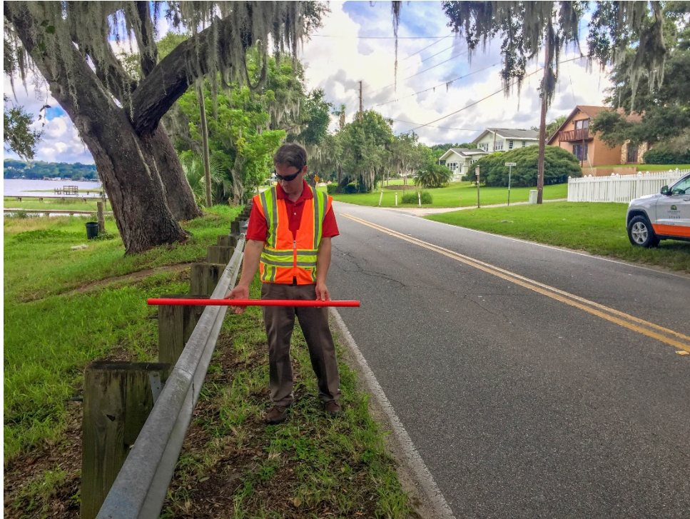
Photo No. 1: Date & Time: 2018:07:18 10:31:00 / Photo Direction of View: 21°