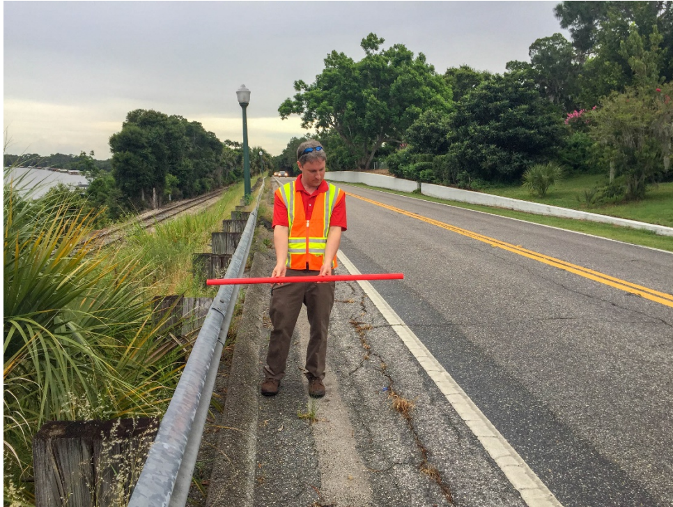
Photo No. 1: Date & Time: 2018:07:18 14:59:58 / Photo Direction of View: 294°