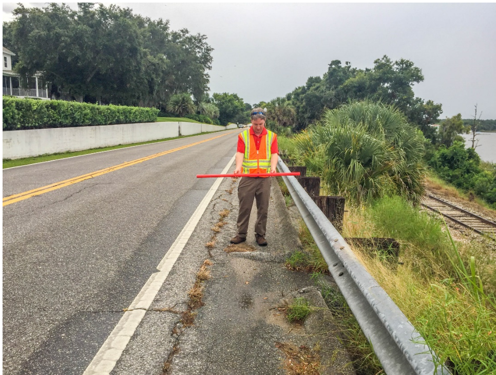
Photo No. 3: Date & Time: 2018:07:18 15:00:29 / Photo Direction of View: 115°