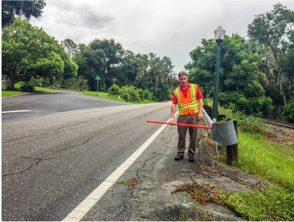
Photo No. 4: Date & Time: 2018:07:18 15:03:21 / Photo Direction of View: 96°