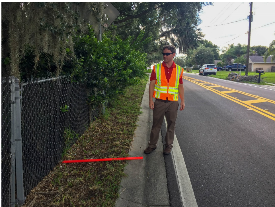
Photo No. 6: Date & Time: 2018:07:18 10:05:44 / Photo Direction of View: 73°