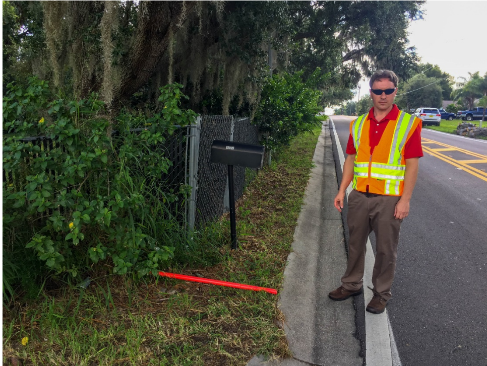
Photo No. 5: Date & Time: 2018:07:18 10:05:28 / Photo Direction of View: 73°