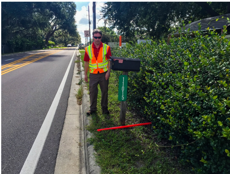
Photo No. 3: Date & Time: 2018:07:18 10:04:46 / Photo Direction of View: 89°