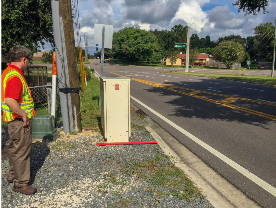
Photo No. 2: Date & Time: 2018:07:18 10:04:12 / Photo Direction of View: 284°