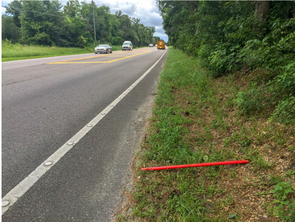
Photo No. 4: Date & Time: 2018:07:18 14:23:27 / Photo Direction of View: 89°