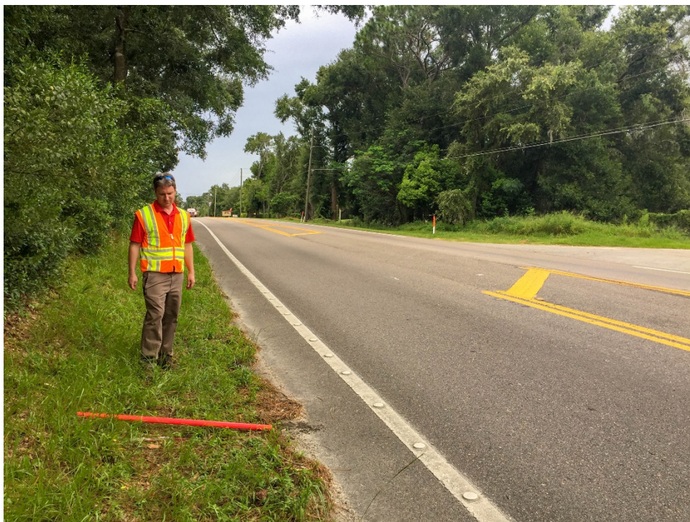
Photo No. 3: Date & Time: 2018:07:18 14:22:46 / Photo Direction of View: 280°