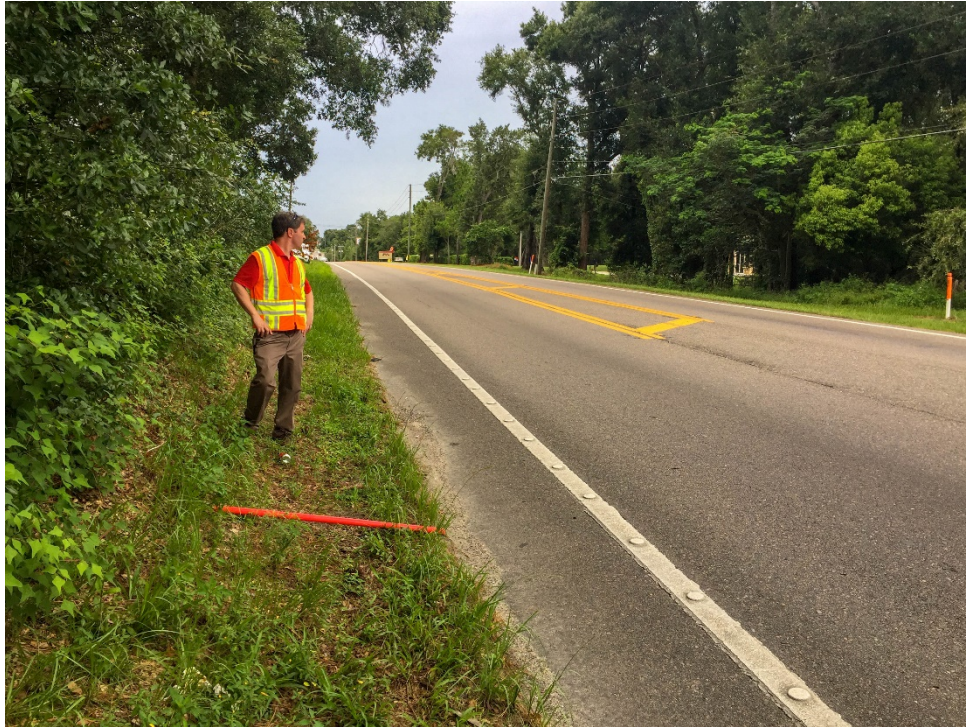
Photo No. 1: Date & Time: 2018:07:18 14:21:22 / Photo Direction of View: 271°