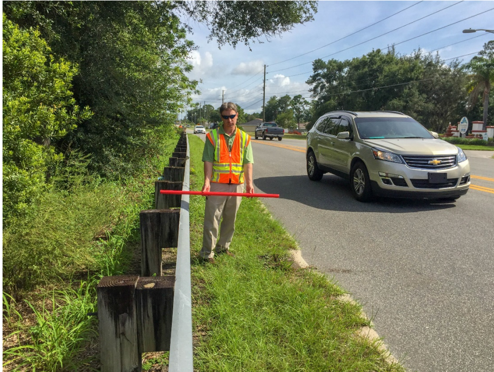
Photo No. 3 : Date & Time: 2018:07:19 10:06:43 / Photo Direction of View: 8°