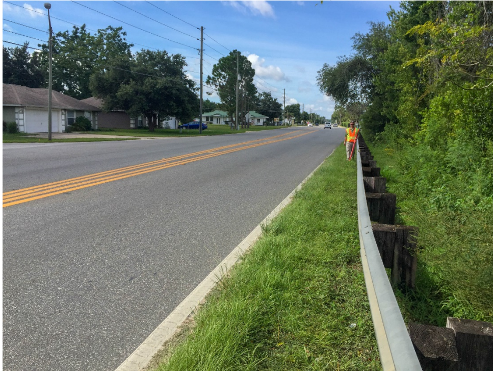
Photo No. 1: Date & Time: 2018:07:19 09:58:46 / Photo Direction of View: 175°