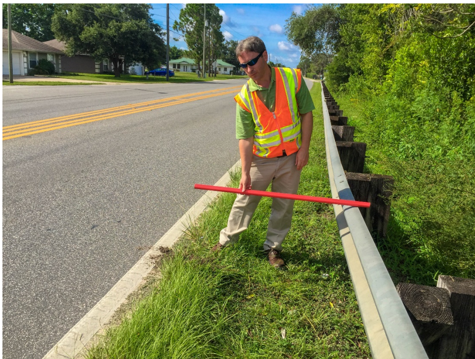
Photo No. 2: Date & Time: 2018:07:19 09:59:33 / Photo Direction of View: 181°