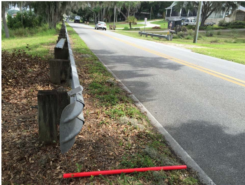
Date & Time: 2016:05:17 10:46:23 / Photo Direction of View: 17°