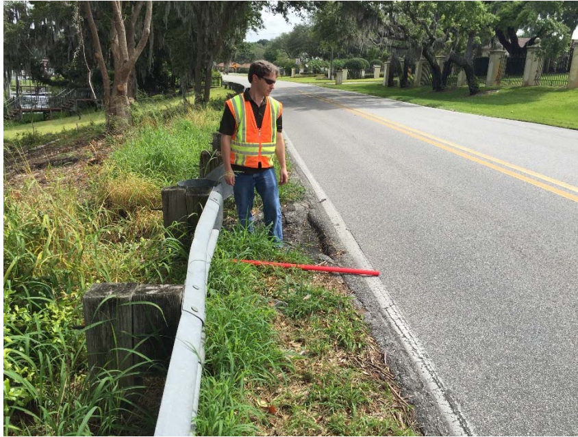
Date & Time: 2016:05:17 10:42:28 / Photo Direction of View: 44°