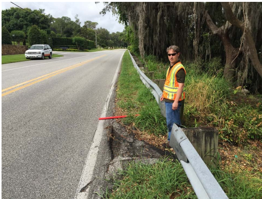
Date & Time: 2016:05:17 10:42:40 / Photo Direction of View: 223°