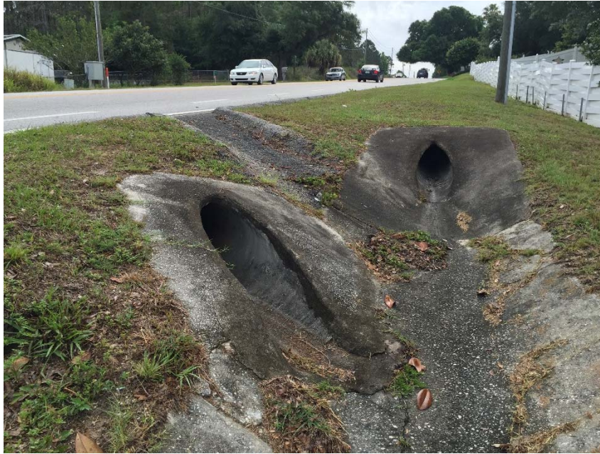
Date & Time: 2016:05:17 09:13:23 / Photo Direction of View: 73°