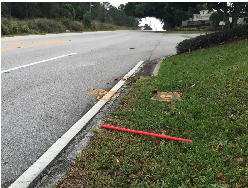
Date & Time: 2016:05:17 09:15:40 / Photo Direction of View: 82°