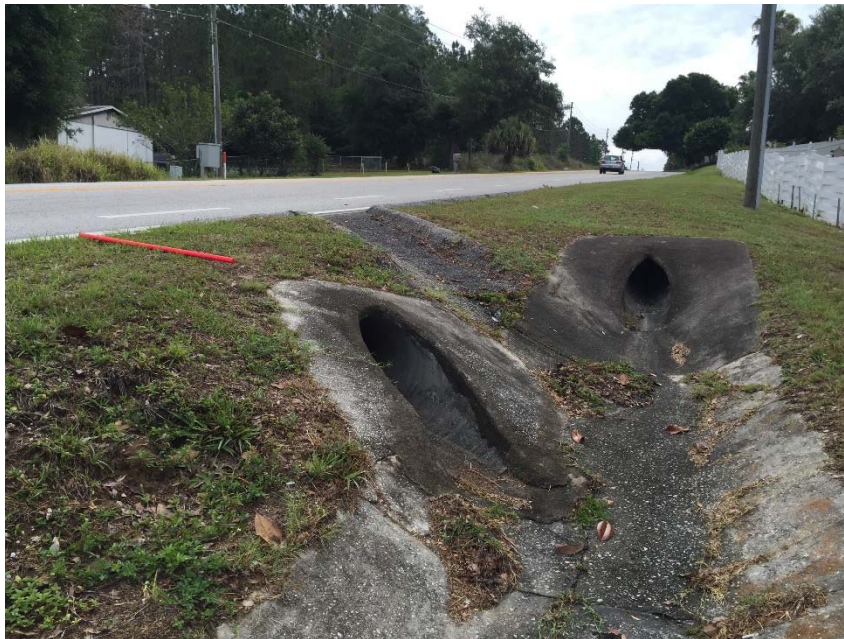
Date & Time: 2016:05:17 09:14:00 / Photo Direction of View: 68°