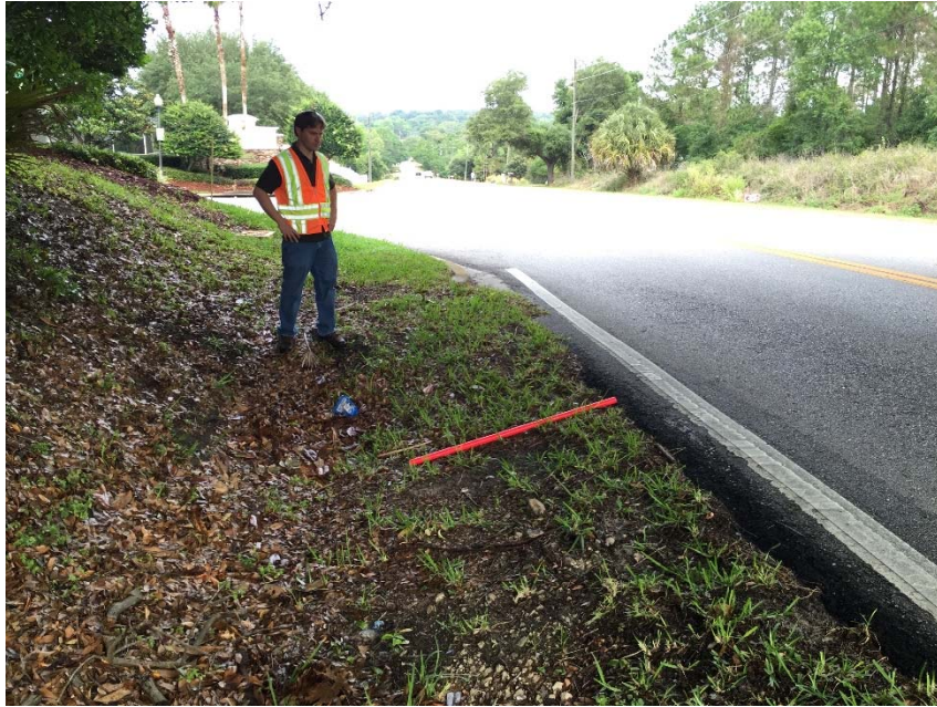
Date & Time: 2016:05:17 09:04:47 / Photo Direction of View: 275°