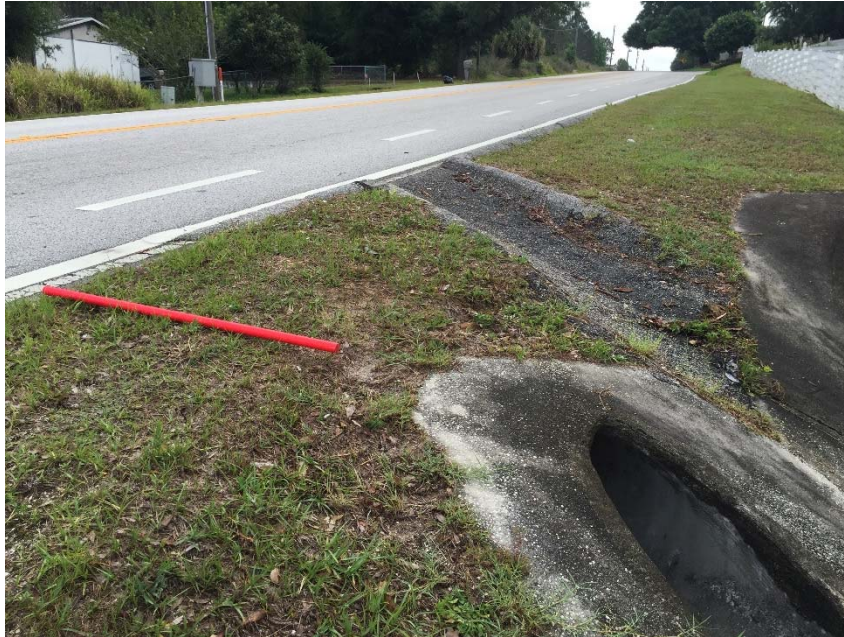
Date & Time: 2016:05:17 09:14:20 / Photo Direction of View: 69°