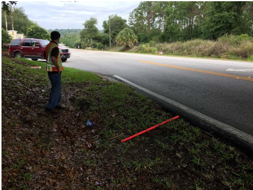
Date & Time: 2016:05:17 09:04:55 / Photo Direction of View: 290°